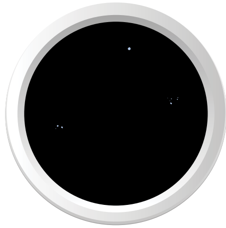
protected by York Defender ® Antimicrobial